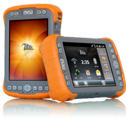
Mesa® Rugged Notepad